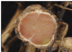
Large, dark pink/red nodules indicate active nitrogen fixation is taking place within the plant. This is caused by leghemoglobin in the plant nodules; very similar to hemoglobin in the blood of vertebrates. Dark pink/red means alive and functioning!

Yes. Carefully dig up grown plants and wash the soil from the roots. Nodules will appear as growths on the roots. Dissect the nodule with a knife. A red “bloodlike” substance will denote an active nitrogen fixing colony.