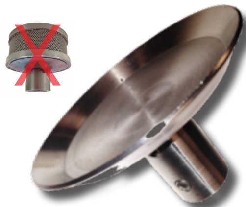
EXAMPLE OF A POORLY MAINTAINED BASKET ATOMIZER